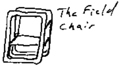
The Field Chair

THE BELOW DIAGRAMS ARE OF THE "FIELD CHAIR" and "FIELD CUBE" THAT ARE USED FOR DEPATTERNING - DEMAGNETIZING A HUMAN.